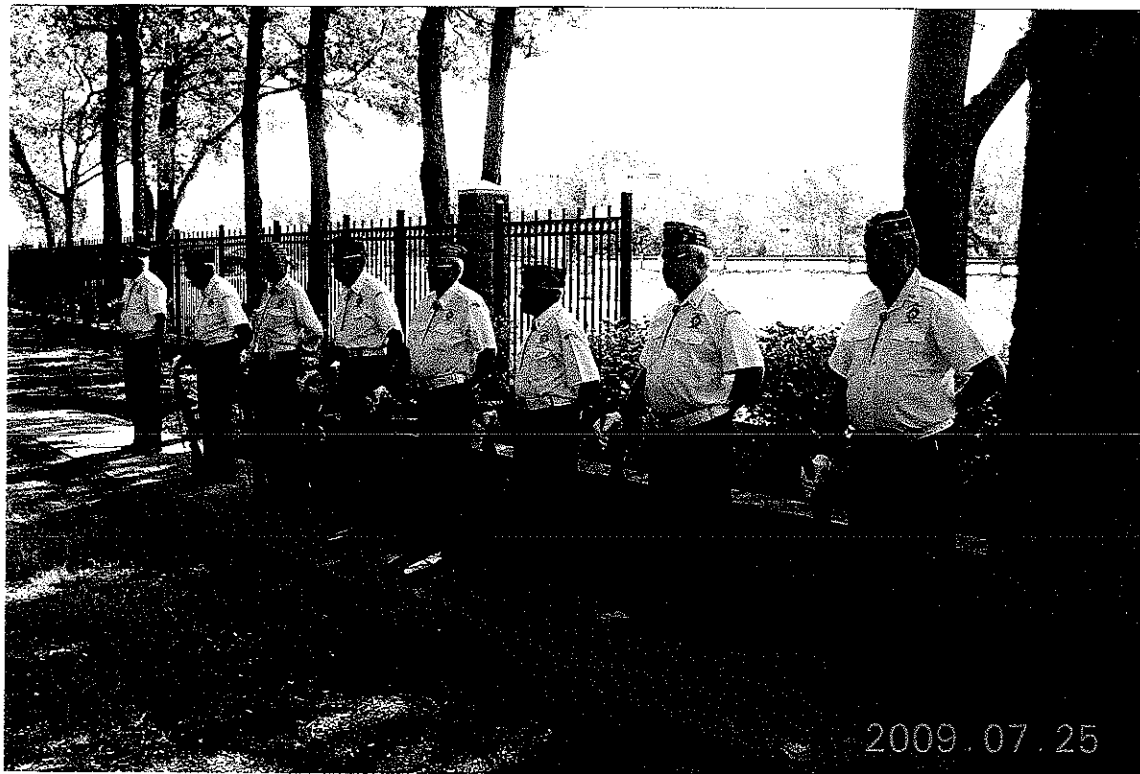
Your Honor Guard at the 56th year Anniversary Armistice of the Korean War, held at Bear Creek Park. Had their usual fine program